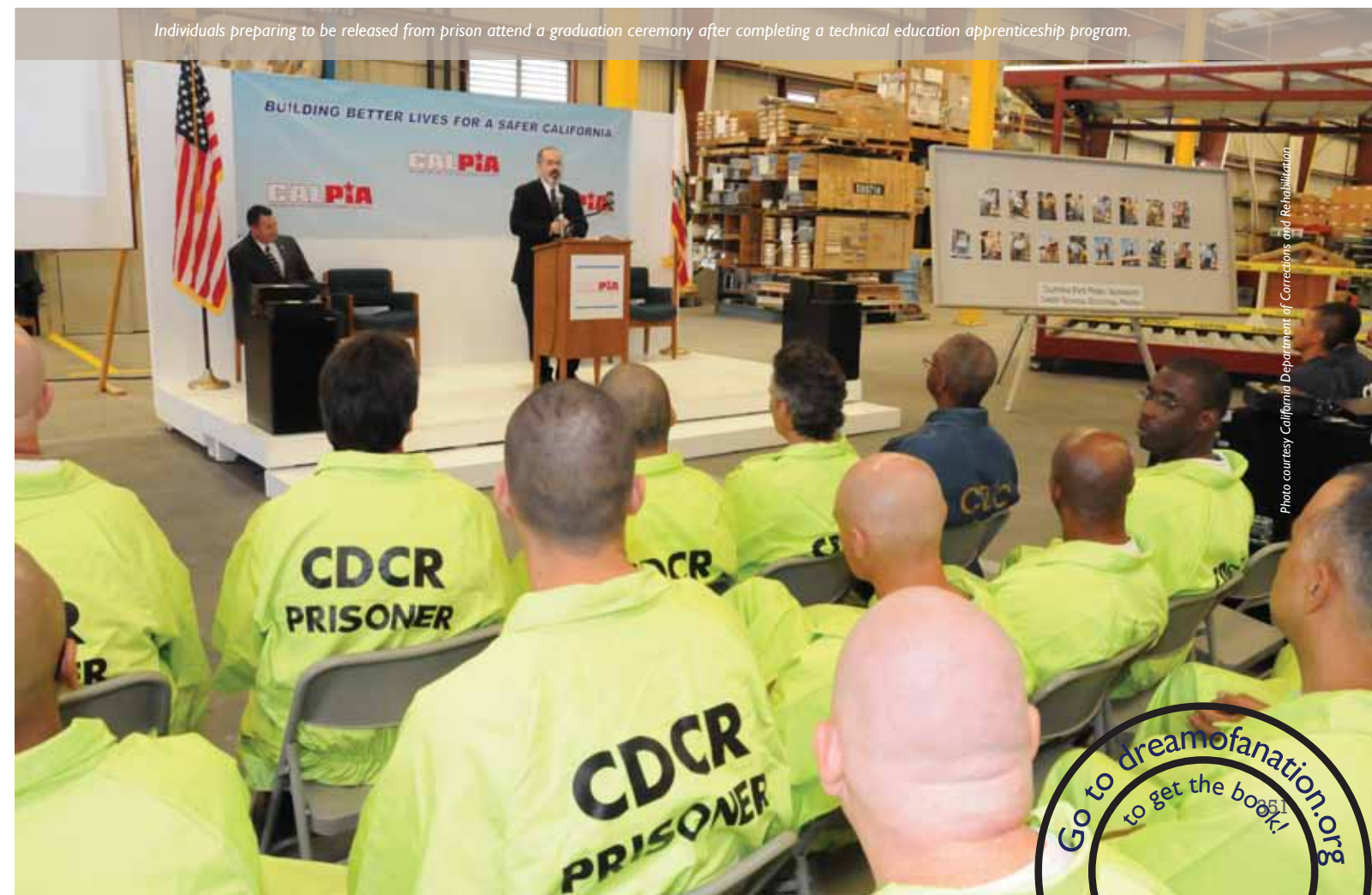
Individuals preparing to be released from prison attend a graduation ceremony after completing a technical education apprenticeship program.

In 2007, Kansas approved criminal justice legislation with the potential to significantly reduce the projected need for additional prison beds. This legislation included the creation of a performance-based grant program for community corrections to reduce parole revocations by 20 percent and restore earned good-time credits for good behavior for individuals incarcerated for non-violent offenses, so that more people will be released on parole. 17 This change in the parole system is projected to save $80 million over the next five years in reduced capital and operating expenses, about $7 million of which will be reinvested in community corrections and substance abuse and vocational training programs.