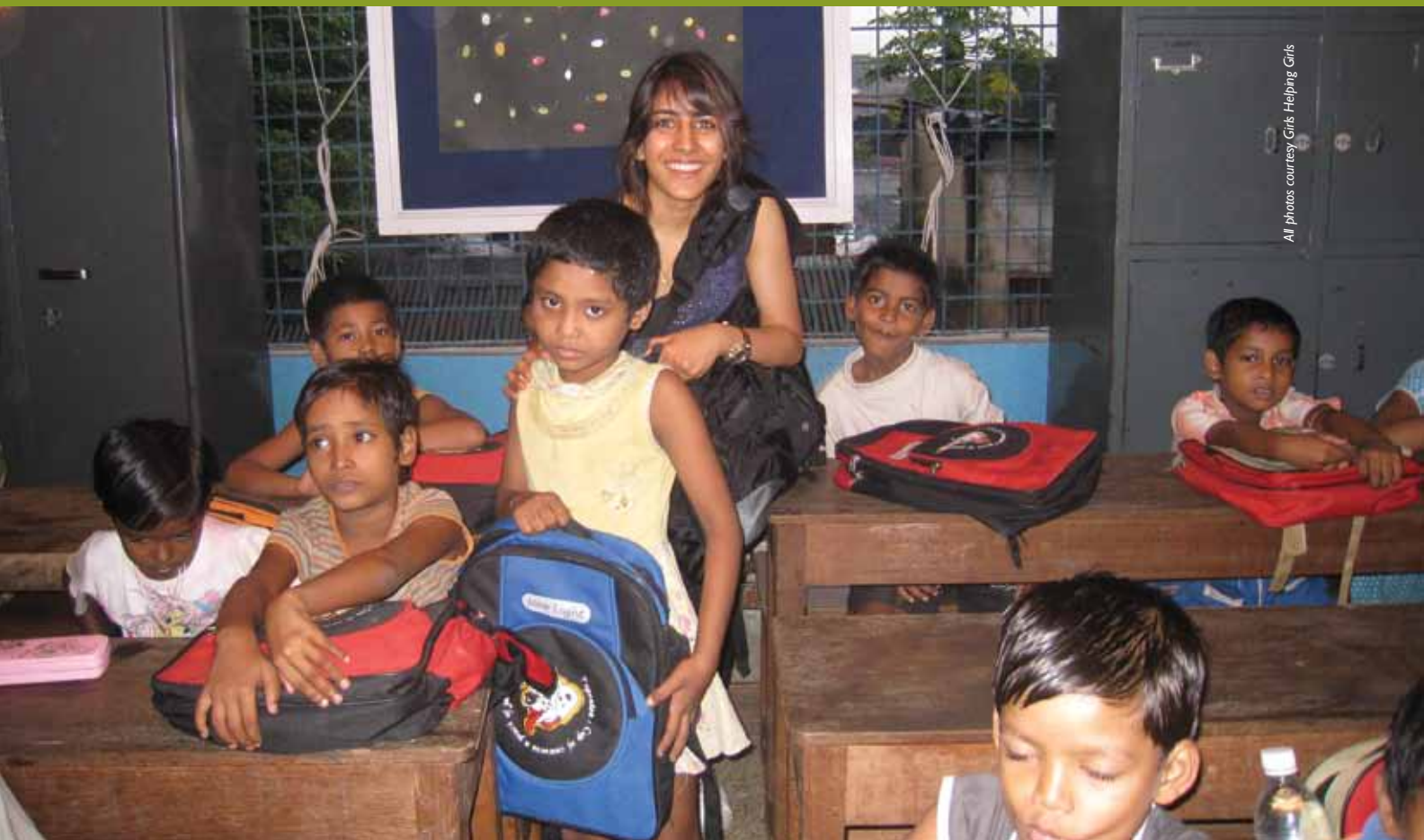
All photos courtesy Girls Helping Girls