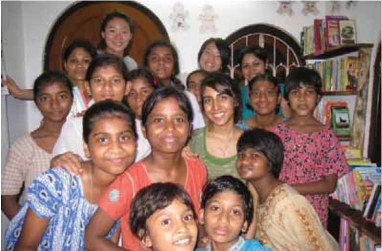
With help from Girls Helping Girls, this community in India was able to build a library to help continue the education of their girls.

And like a viral message, our mission spread and spread until it became a global movement unrestrained by a single director, but burgeoning with a mind of its own. Today, less than three years after first sketching our logo on a piece of scrap paper in the high-school library, our small team has mobilized and trained over 30,000 young women to create innovative and substantive change. With no hired advisors and not even a board of directors, we have provided girls from more than 20 countries the one-on-one mentorship, toolkits, funding and support network to build their own microenterprises, advocate against human rights abuses, construct holistic income-generation programs and create sustainable development initiatives in their communities. And we have raised over $60,000 to enable girls around the world to go to school.