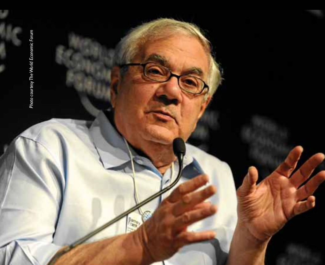
Representative Barney Frank and his 16-member task force are working to garner the support of other members of Congress to include military spending cuts in any national deficit reduction plan.

Representative Barney Frank along with others who are working on financial regulation reforms assembled a bipartisan task force that identified nearly $1 trillion in savings that could be extracted from the Pentagon budget through 2020.