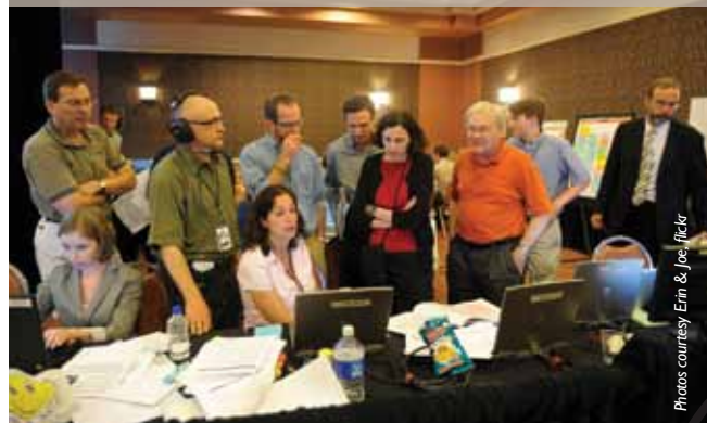
Citizens participate in an AmericaSpeaks meeting in Philadelphia.

The organization aims to develop a national infrastructure for democratic deliberation that links decision-makers and citizens in determining public policy.