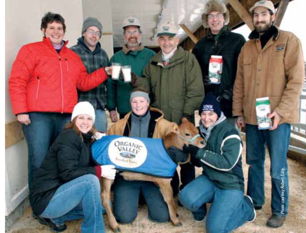
Organic Valley was started in Wisconsin in the 1980s and is now owned by over a thousand farmers in 32 states.

Democracy is grounded in the notion of a “common good”—an understanding that our individual well being depends on the well being of the whole society. Businesses that close the gap between owners and workers for the common good are growing fast. Cooperatives are one example of a democratic business organization, where owners are also the business’ workers or users of its services. In all their varieties—from finance to housing, farming, manufacturing and more—equitable sharing of responsibilities and benefits is a key value. Co-op membership jumped ten-fold in the last half century, now providing 100 million jobs worldwide. That’s one-fifth more jobs than multinational corporations offer, according to the International Co-operative Alliance.