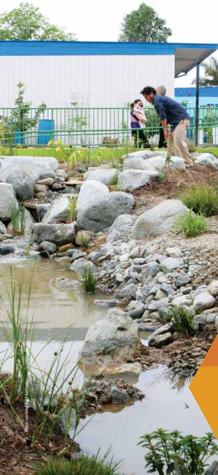
A teaching garden at the Environmental Charter High School provides hands-on learning that compliments the vigorous in-classroom curriculum.

For example, the Environmental Charter High School in Los Angeles combines “a rigorous college-preparatory curriculum with hands-on learning opportunities in the community.” While 80 percent of the students are financially disadvantaged, all students must be admitted to a four-year university in order to graduate. The school’s philosophy employs project- and service-based learning as well as an interdisciplinary approach that incorporates environmental science and ecology-inspired activities across all disciplines. In addition to classroom programs, students are required to apply concepts and skills gained in class to problem-solve local civic and environmental issues. Founded by a group of parents, educators, businesses and non-profits in 2000, the school has experienced dramatic improvements in academic results. The school was called “a model of learning” by President Obama, 1 and US News & World Report placed it in the top 3 percent of US public high schools.