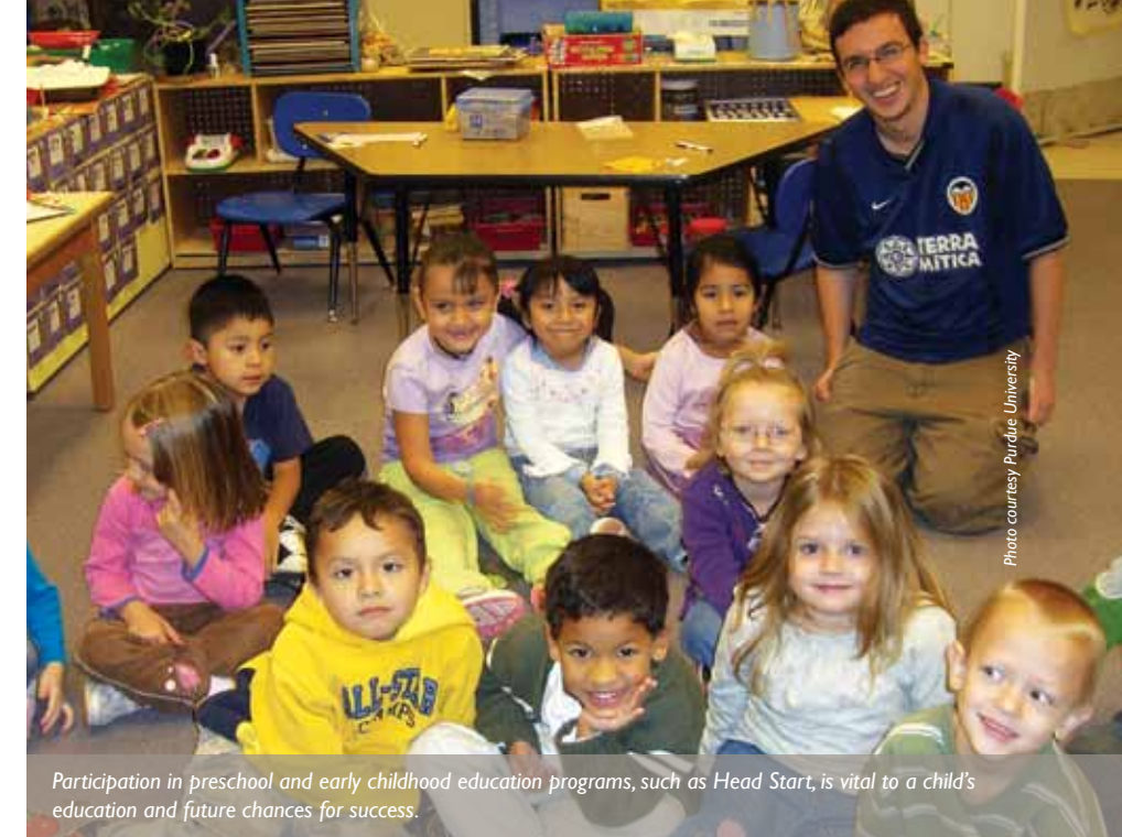
Participation in preschool and early childhood education programs, such as Head Start, is vital to a child's education and future chances for success.

3) Education. Education truly opens doors to new opportunities and forms a solid pathway into the middle class. However, in order to be successful, it must work at every level. Thus, children require access to quality early childhood education. Only 74 percent of four-year-olds and 47 percent of three-year-olds par-