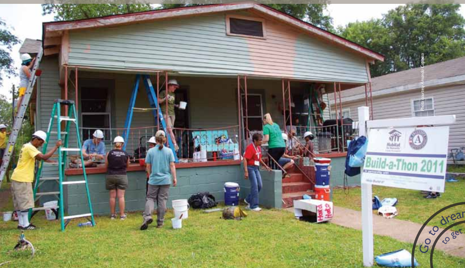
AmeriCorps volunteers participate in Habitat for Humanity's 2011 Build-a-Thon, a national event that provides opportunities for youth to share ideas and meet others who are committed to eliminating poverty housing.

The Obama administration agrees that continued effort should be placed into improving pre-K–12 education through measures designed to expand learning time, promote high expectations and accountability, improve teacher quality and increase access to valuable programs and services. For example, the Obama administration's Early Learning Challenge Grant proposal challenges states to develop effective, innovative models that promote high standards of quality and a focus on outcomes across early learning settings, and would dedicate $10 billion over ten years toward this effort. 19 "For every $1 we invest in these programs, we get $10 back in