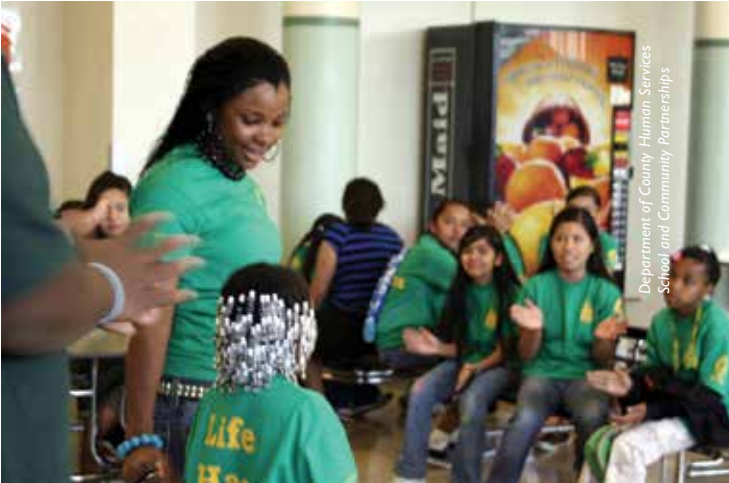
Students put on a show after school at one of Multnomah County's SUN Community Schools.

There are a growing number of communities that are moving this school and community agenda forward. Cincinnati's Board of Education established a policy that all schools built under a major school reconstruction program will be Community Learning Centers. Each school has a different physical and program design that reflects the needs and aspirations of neighborhood residents. The intensive community engagement process that led to these school plans distinguishes Cincinnati's initiative. Networks of community partners focused on extended learning, physical health, mental health, college access and parental engagement, and the partners provide these services at the schools. A full-time resource coordinator, employed by an external partner (i.e., YMCA) integrates the work of community partners in the school, while